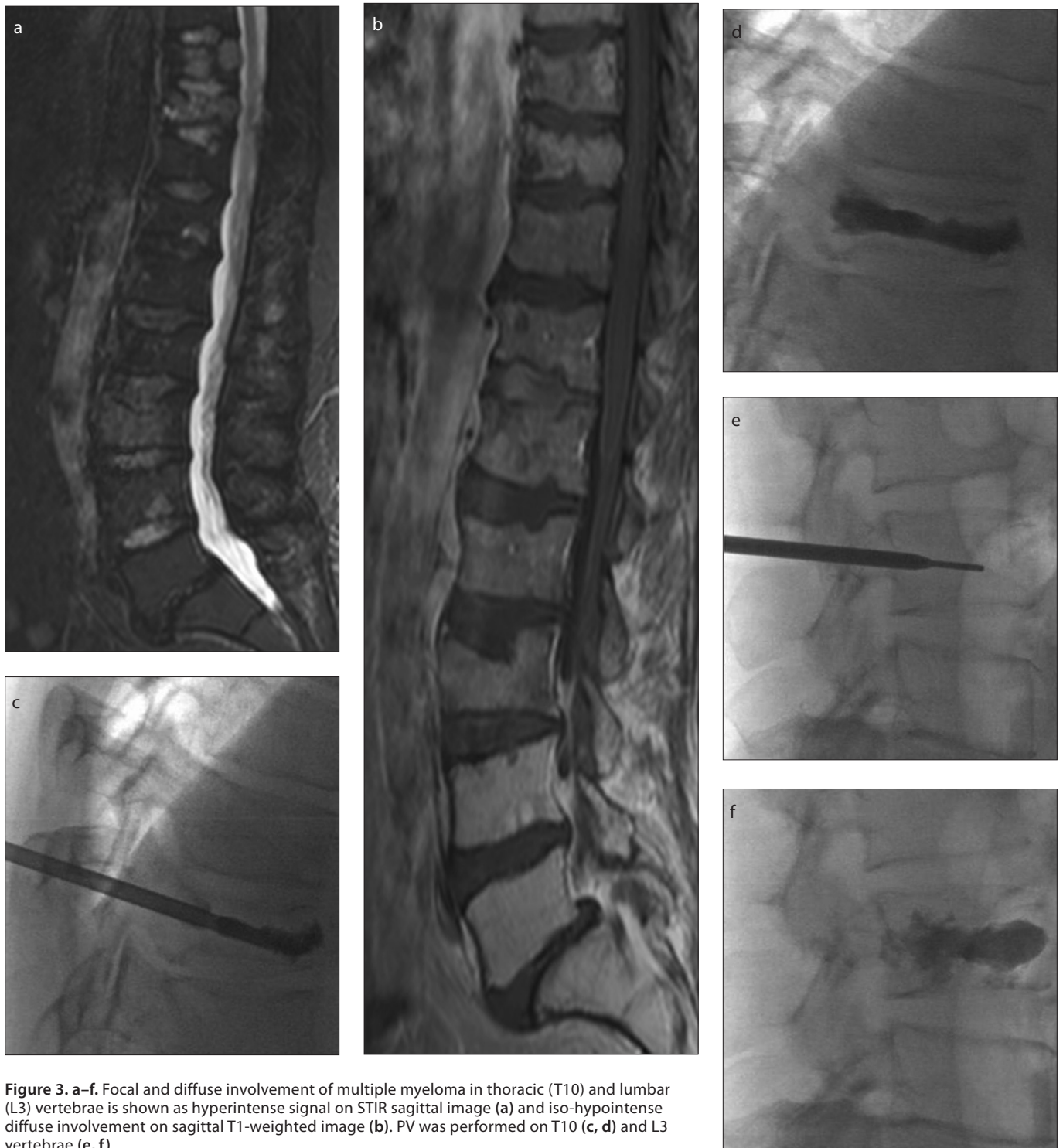
Figure 3. a–f. Focal and diffuse involvement of multiple myeloma in thoracic (T10) and lumbar (L3) vertebrae is shown as hyperintense signal on STIR sagittal image (a) and iso-hypointense diffuse involvement on sagittal T1-weighted image (b). PV was performed on T10 (c, d) and L3 vertebrae (e, f).

complications are usually asymptomatic. Complications during PV can be prevented by bringing the needle tip into the proper position under fluoroscopy (11). Other possible complications include vertebral transverse process or pedicle fractures, paravertebral hematoma, epidural abscess, pneumothorax, cerebrospinal fluid leakage, seizure because of oversedation or respira-